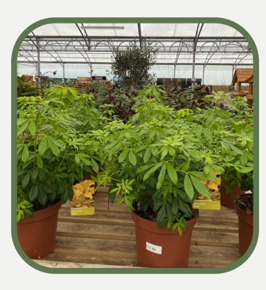
Transplant deciduous shrubs growing in the wrong place, while they are dormant