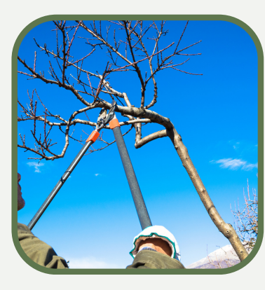
Prune winterflowering shrubs that have finished flowering