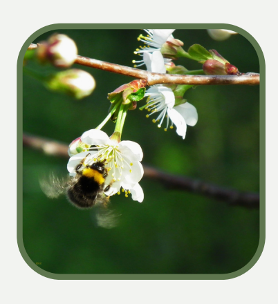
Protect blossom on apricots, nectarines, and peaches