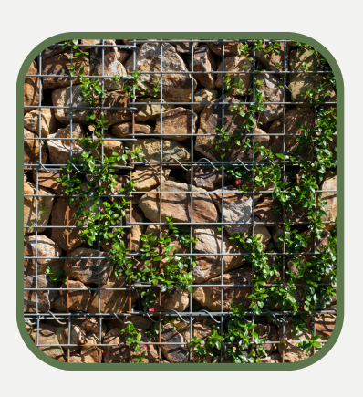
Net fruit and vegetable crops to keep the birds off