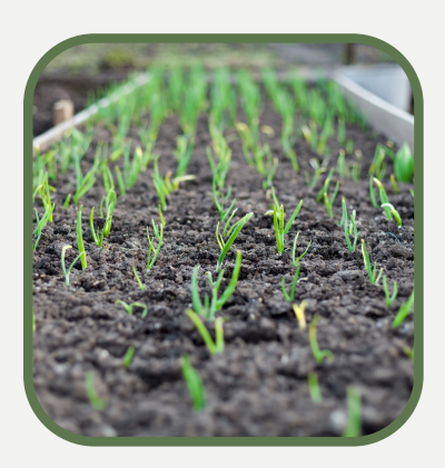
Prepare vegetable seed beds, and sow some vegetables under cover