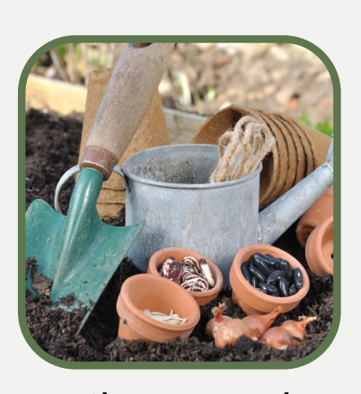
Clean pots and greenhouses ready for spring, to help control pests and diseases.