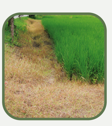
Cut back deciduous grasses left uncut over the winter, remove dead grass from evergreen grasses