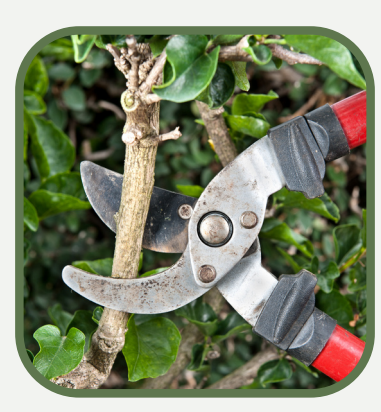
Cut away all the old foilage from epimediums with shears, before the spring flowers start to develop